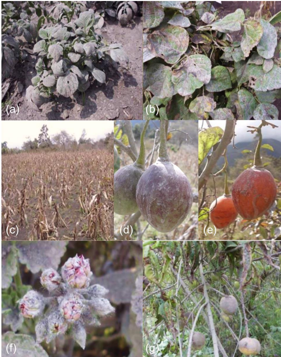
Figure S1 Photos illustrating tephra-induced damage to various crops in the region affected repeatedly by the explosive eruptions of Tungurahua volcano (1999-2014). potato: tephra retention on foliage (a); frijole: leaf yellowing and drying following exposure to tephra (b); corn: dying plants with dried, yellowy-brown leaves that received tephra during the flowering stage (c); tamarillo: tephra adhering to immature (d) and mature (e) fruits; blackberry: young fruits covered with tephra (f); peach: “burnt” leaves and fruits coated with tephra (g)