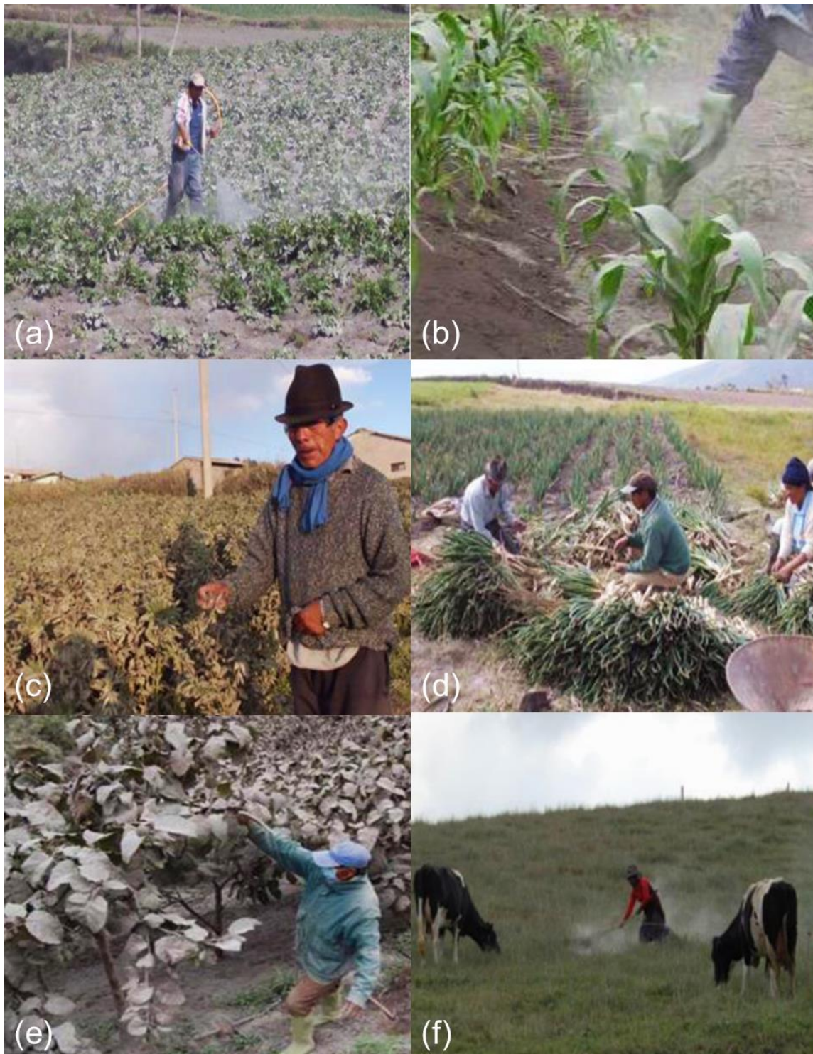
Figure S2 Photos illustrating the mitigation measures for tephra impacts on crops deployed by farmers in the region affected repeatedly by the explosive eruptions of Tungurahua volcano (1999-2014). potato: cleaning of tephra-covered foliage with water (a); corn: manual shaking of individual plants to shed off tephra (b); fava bean: manual removal of tephra from individual plants (c); white onion: inspection and manual cleaning of the harvested produce (d); tamarillo: manual shaking with a stick of the tephra-covered leaves (e); pasture: dusting off of tephra deposited on grass by swirling a around a stick (f).